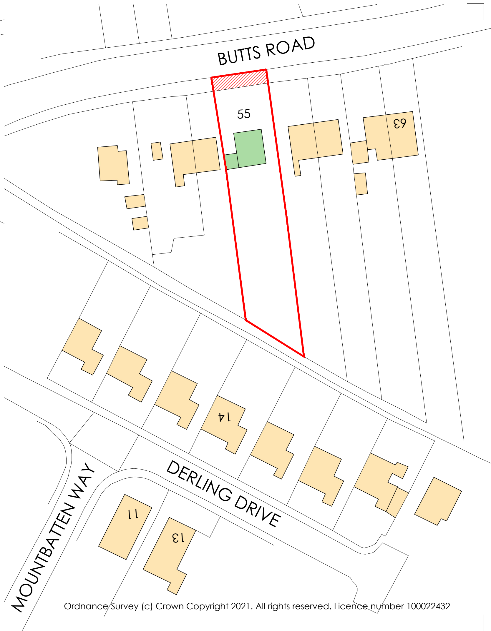
BLOCK PLAN @ 1:500

Ordnance Survey (c) Crown Copyright 2021. All rights reserved. Licence number 100022432